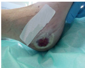
Figure 4. Day 0: The wound measured 3.4cm 2

The Maxxcare Pro Evolution Heel boot has a non-slip base to help patients to move from bed to chair. After application of the Maxxcare Pro Evolution Heel boot, the patient reported that her foot felt more comfortable and the foot plate of her wheelchair no longer felt uncomfortable. By day 7, the wound had decreased in size by 1.9cm 2 and the wound continued to improve. On day 14, the wound had decreased to less than 0.5cm 2 in surface area (Figure 5). Due to her positive experience, she continued to wear the boot post-evaluation.