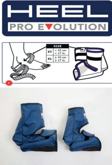
Figure 2. Size guide

Implementing an effective heel protection programme involves adopting a multi-faceted approach which includes performing a risk assessment and undertaking a comprehensive examination of skin integrity in those patients deemed at high risk of pressure damage (NICE, 2014). The strength of evidence suggests that the ideal pressure-redistributing techniques for offloading the heels should reduce pressure, friction and shear; separate and protect the ankles; maintain heel suspension; and prevent foot drop (Black, 2004).