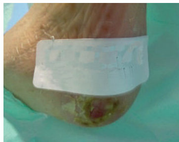
Figure 5. Day 14: the wound had decreased to less than 0.5cm 2