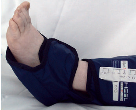
Figure 1. Example of Maxxcare Pro Evolution Heel boot offloading the left foot