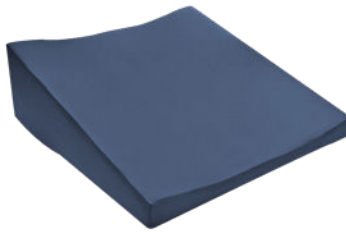
OPTIONAL WATER PROOF POLYURETHANE HYGIENE COVER