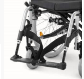
Detachable, swing-away legrests. Footplates angle-adjustable, incl. single calf strap.