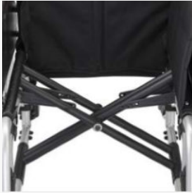
Double scissor standard