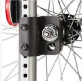
Wheelbase extension by turning the varioblock backwards