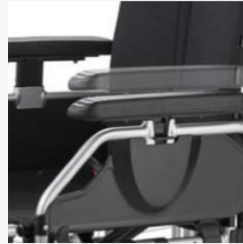
Height-adjustable side panel with depth-adjustable armrest