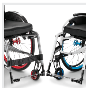
Fixed leg and swingaway options

Adjust leg, foot rests and castors. A redesigned braking system for easy braking