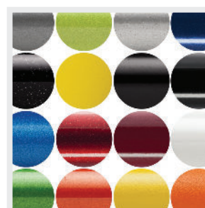
Lots of frame and wheel colour choices