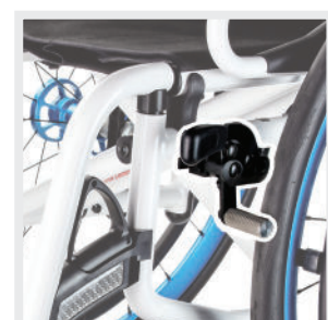
Redesigned, easy-to-activate brakes