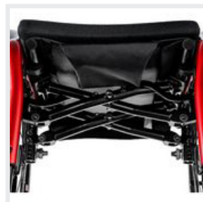
Double cross brace for rigid frame-like ride performance.