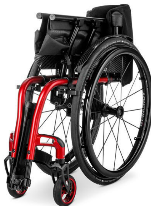
Convenient folding function for storage and travel.

+ Minimum wear due to high quality attachments.