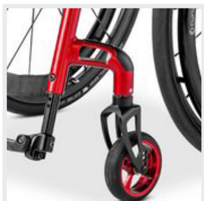
Castor wheel connection milled from solid material.