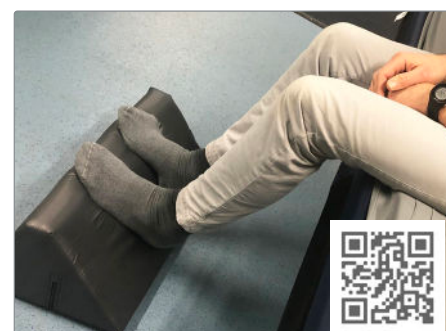
10) At feet to stop user from sliding out of bed/chair/bed or for user to push further back