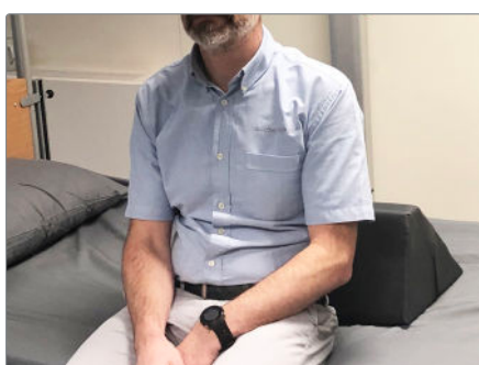
5) As a backrest