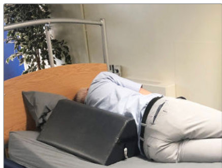
1) To support from the back for personal care