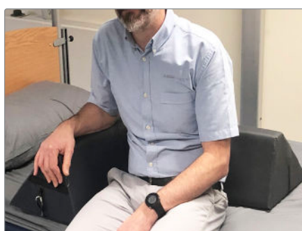
6) Support from the back and side