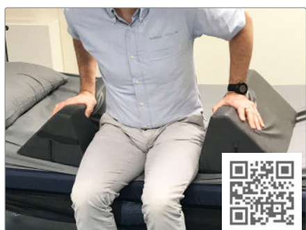
8) Gives the user something stable to push up on when standing from the bed