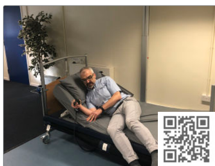
9) Support from behind when coming up to sitting