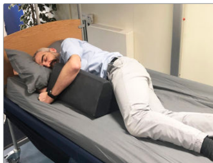
2) Or support from the front for personal care