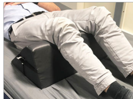
3) Assist with wound dressing and clothing for lower legs