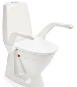
My-Loo with armrests 2 cm

The clean, smooth surfaces are easy to wipe with a soft cloth. Should separate cleaning be required, the seat and armrests are easy to remove from their brackets and equally simple to put back in place.