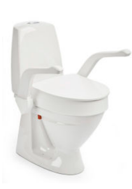
My-Loo with armrests 10 cm