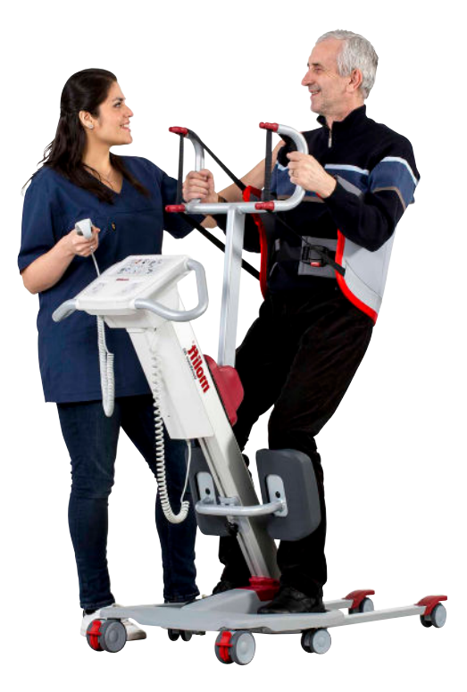
RgoSling Active and Quick Raiser 205 with 4-point lifting arm

Molift RgoSling StandUp is designed for a 2-point lifting arm. It is quickly and easily placed around the user. By virtue of the design it is ideal for use in toilet situations.