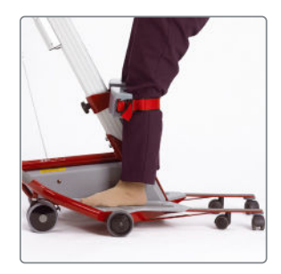
Extra low base

The extra low base of 7 cm, and narrow front, 34 cm, fits well around toilets and under most beds, chairs and wheelchairs