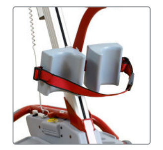
Multiple adjustable knee pads

The extra low base of 7 cm, and narrow front, 34 cm, fits well around toilets and under most beds, chairs and wheelchairs