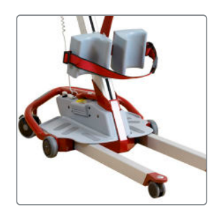
Unique wheel positioning

All Molift hoists have an integrated battery indicator that provides audio and visual notification.