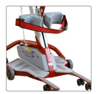
Unique wheel positioning

Battery indicator on the hand control showing when charging is needed.