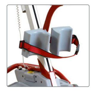
Adjustable knee pads

A perfect alternative when the hoist is used together with chairs with no accessibility underneath, such as electric wheelchairs and recliners.