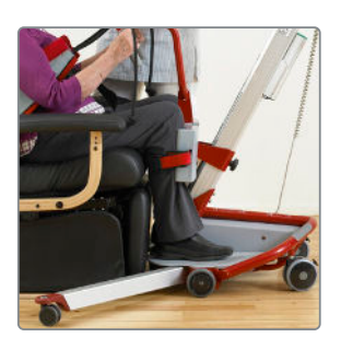
Electrically adjustable legs

A perfect alternative when the hoist is used together with chairs with no accessibility underneath, such as electric wheelchairs and recliners.