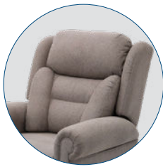
Lateral Support Backrest KA554-LS