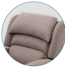
Standard Support Backrest KA554-SB