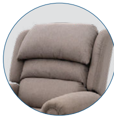
High Support Backrest KA554-TB