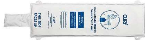
PART NUMBER: 3515