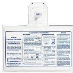
PART NUMBER: 2630