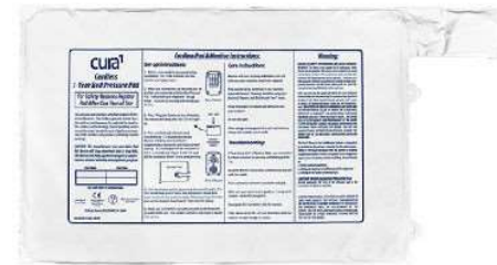
PART NUMBER: 2629