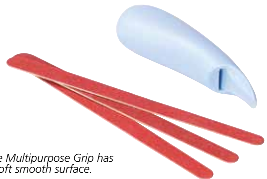
The Multipurpose Grip has a soft smooth surface.

Beauty Multipurpose grip rests securely in the whole hand and offers a variety of use. With a poor hand function it can be very difficult to use a nail file. By inserting a nail file into the narrow end, a pedicure can be done with ease. The wider end of the grip may be used for a tooth brush or shaver.