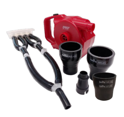
Fast Inflation/deflation pump

Setup or deflate mattress in under 2 minutes