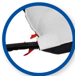
DUAL CONNECTION POINTS