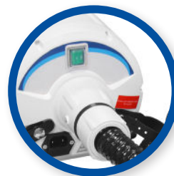
COMPATIBLE PUMP DESIGN*