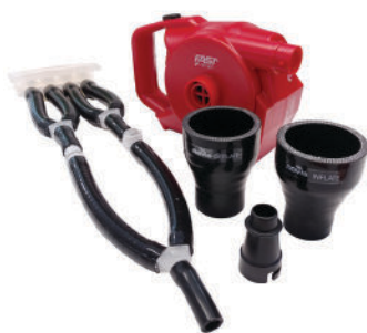
Fast Inflation/deflation pump

Setup or deflate mattress in under 2 minutes