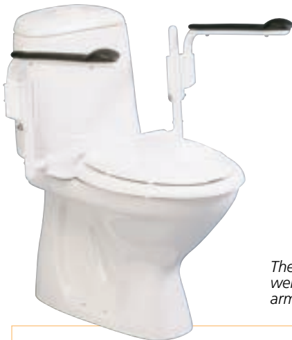
The certified maximum weight capacity per armrest is 75kg