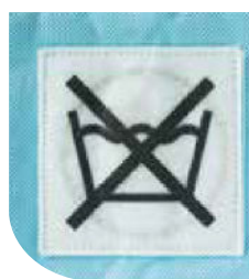
Disposable sling wash label, before a wash

The wash label on the back of the sling displays the DO NOT WASH symbol. If the sling is immersed in water, this label disintegrates to display the DO NOT USE symbol. Dispose of the sling immediately if this symbol is showing.