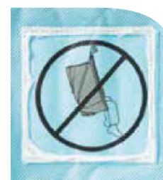
Disposable sling wash label, After a wash