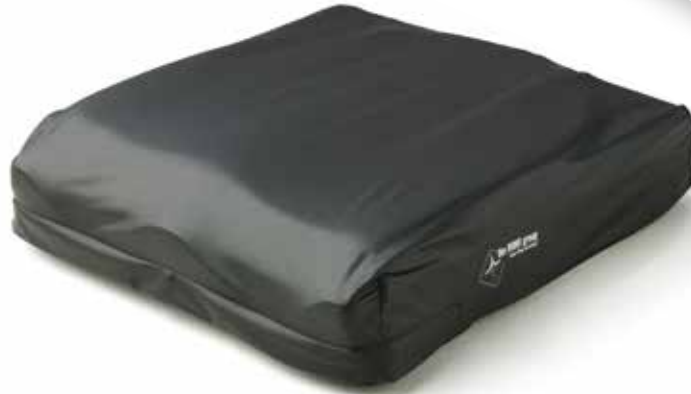
Heavy Duty Cover (waterproof, incontinence cover) available as optional accessory.

ROHO DRY FLOATATION products are made of soft, flexible interconnected air cells designed to conform to each user's individual body shape and self-adjust with every movement, enhancing blood flow and supporting posture. The low surface tension allows for immersion without tissue deformation, minimising the risk of skin breakdown.