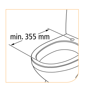
Min. 355 mm Hi-Loo fits most types of toilets. The distance from the attachment holes to the inner front edge must be minimum 355 mm.