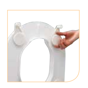
Secure fitting The brackets are covered with friction rubber and adjustable to fit the shape of the toilet bowl. Hi-Loo fits all common types of toilet.