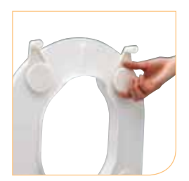
Description Item no. Brackets, pair Compl. Hi-Loo brackets to stabalise