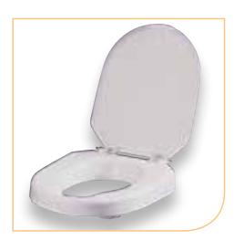
With lid Hi-Loo is also available with lid.