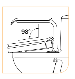
Angled Hi-Loo Angled is recommended for users with impaired knee and hip mobility.